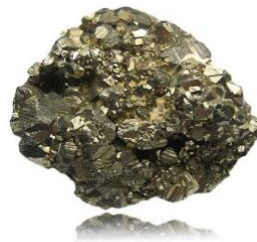
PYRITE or "FOOL'S GOLD"